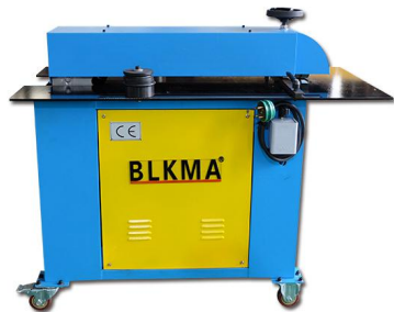
Reel Shear Beading Machine